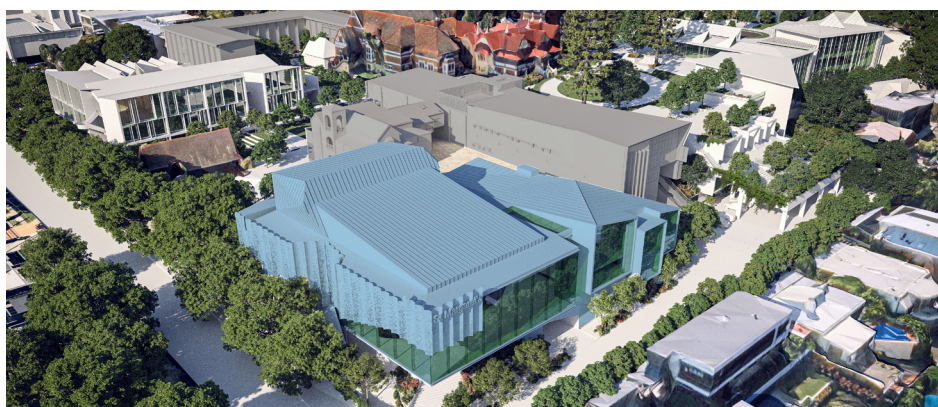
Artist's impression shows aerial view of the development site. It represents size and scale not materiality and colour.

The Blight Rayner-designed precinct will be built in two stages and provide music performance, rehearsal and teaching spaces befitting the outstanding quality of our students' output.