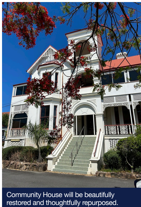
Community House will be beautifully restored and thoughtfully repurposed.

The SMAP will be stepped back in height as Lapraik Street heads north, from a height of approximately 20 metres along its southern edge to approximately 22 metres on the northern side.