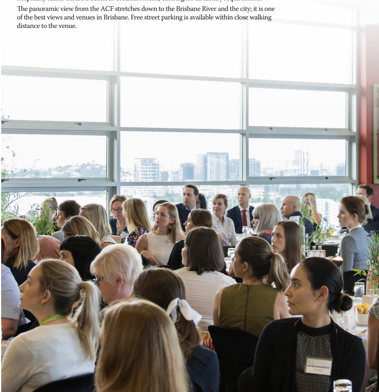
Inside the Arts Centre Foyer