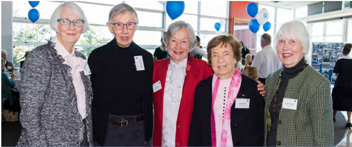
Five OGA prize winners from the 1944 to 1954 who attended the 60 year + reunion.