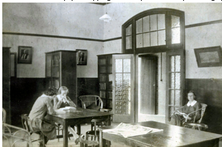
Betty Bromfield – Studying in the library 1939

Students' snapshots of their school days are an invaluable resource for documenting the history and traditions of the school. The formal team photos paint