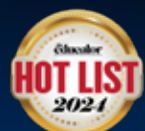
Dean of Studies