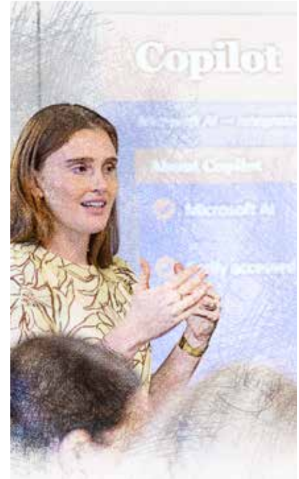
Fostering People-Led Technology Efficiencies