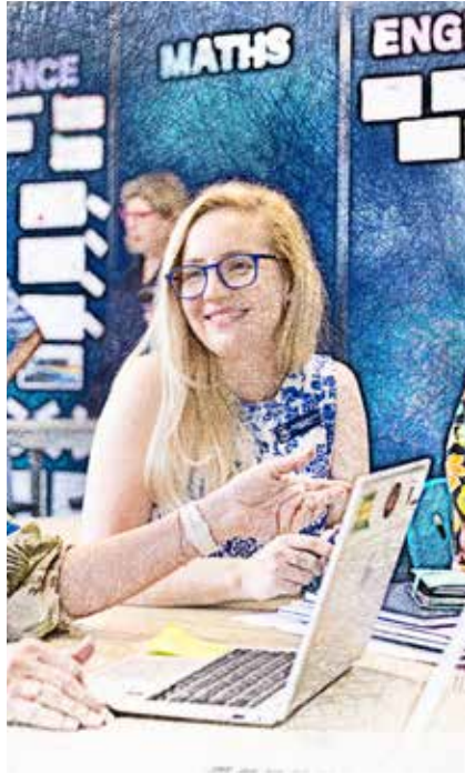
Agile Workplace and Talent Management