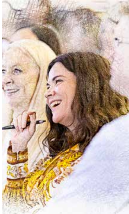
Wellbeing and Belonging