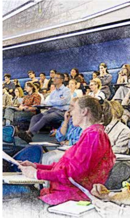
Future Focused Staff and Leadership Development