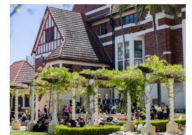
Godlee Arbour and Barley Sugar Garden