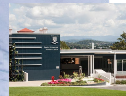
Eunice Science and Resource Centre