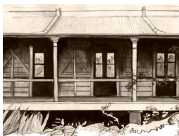
Eton High School founded